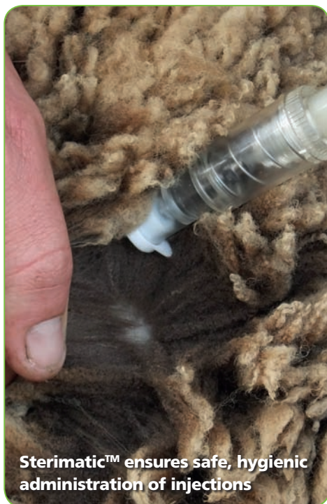
Sterimatic™ ensures safe, hygienic administration of injections