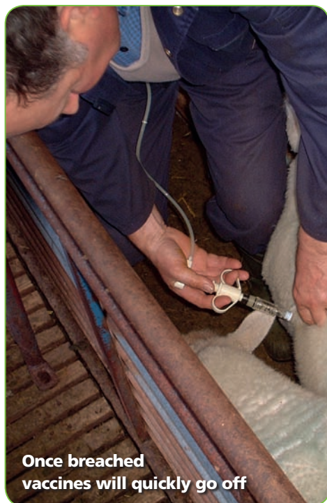
Once breached vaccines will quickly go off